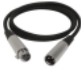
CBI MLN-3 Performer Series