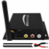
Speco Technologies AS1 a-Live WiFi

Image Product name SKU QTY Price Subtotal 1 $499.00 $499.00